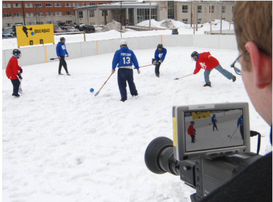
A Michigan Tech student captures a broomball match for a live multicast