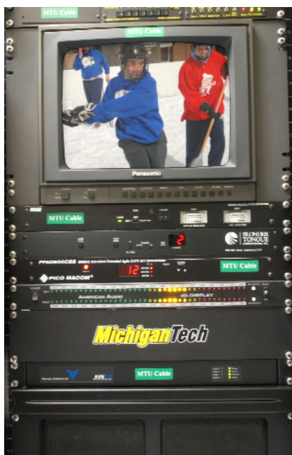
An AVN210 encoder in one of Michigan Tech's data centers, streaming video out to Internet2