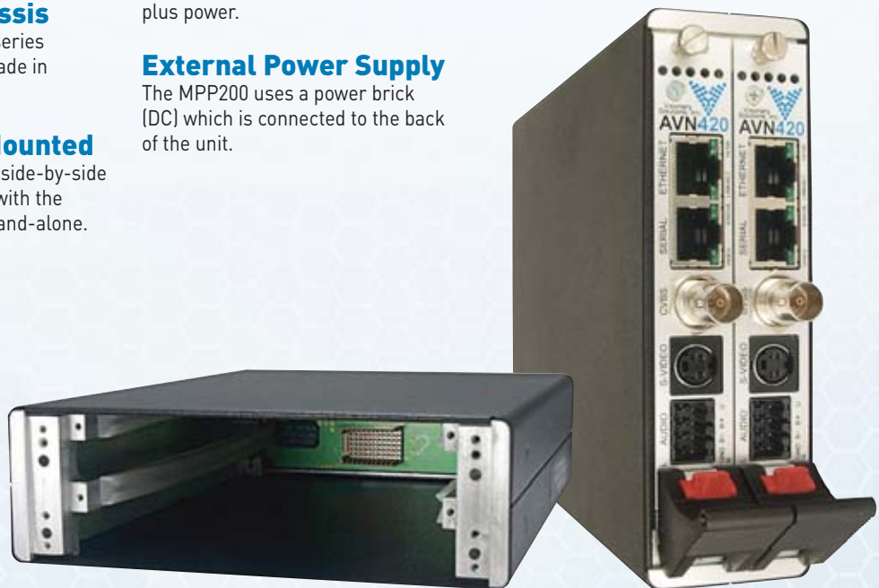
The MPP200 shown empty and with two AVN420 encoder blades installed

The MPP200 uses a power brick (DC) which is connected to the back of the unit.