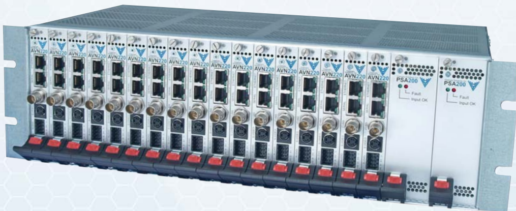
The MPP1700 shown with 17 SD encoder blades and two PSA200 power supplies installed

The MPP1700 is 3RU high and mounts in a standard 19" equipment rack.