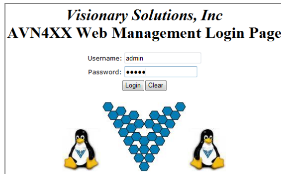
Figure 1 Web Interface Login